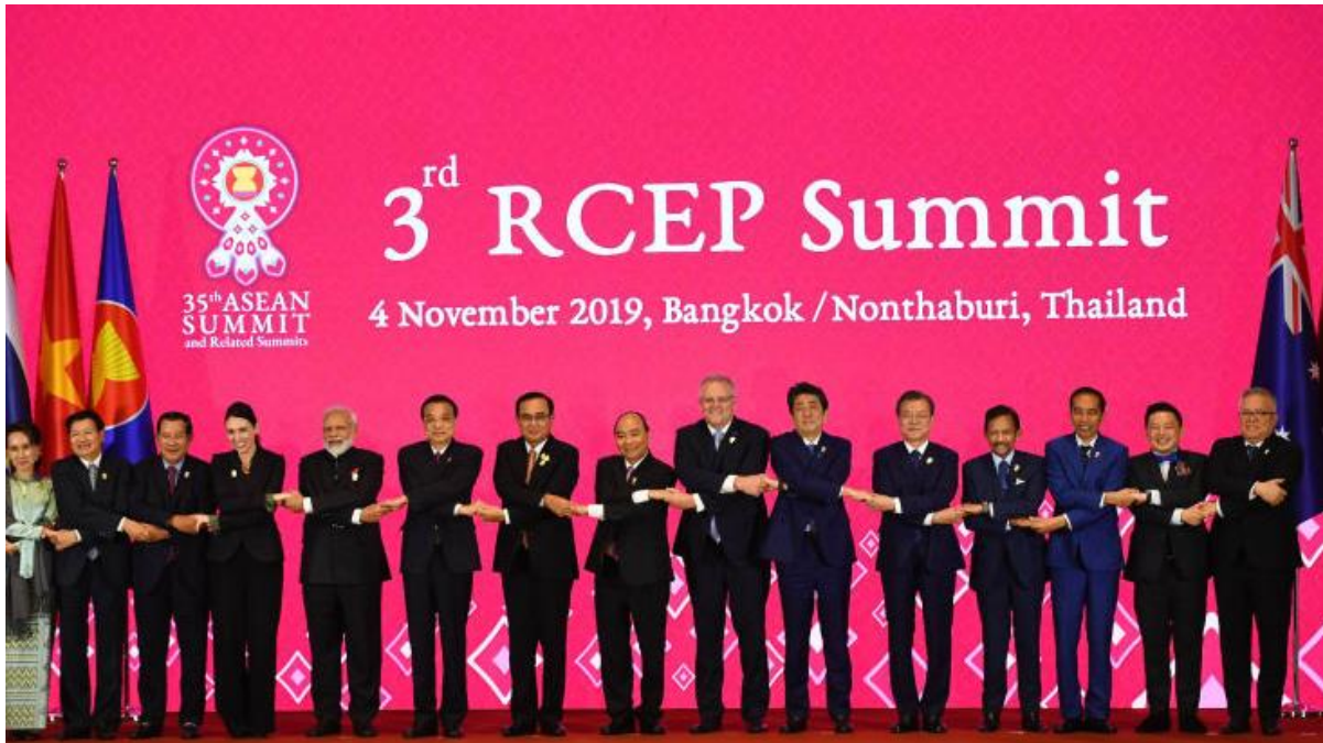
The 3rd Regional Comprehensive Economic Partnership (RCEP) Summit was held in Bangkok on November 4, 2019, on the sidelines of the 35th Association of Southeast Asian Nations (ASEAN) Summit.

"contempt/apathy" towards ASEAN, as against China's renewed focus on the region 7 .