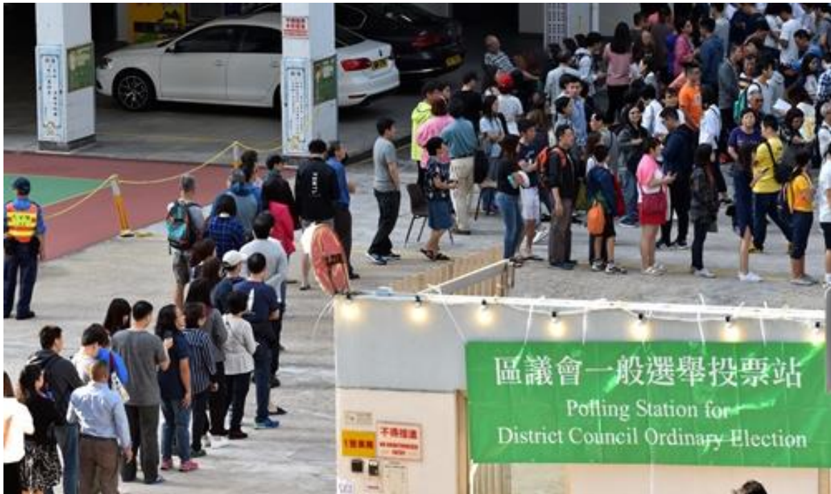
Hong Kong's Pro-democracy candidates won a sweeping victory in the district council elections, November 24, 2019

Furthermore, China strongly condemned the new US law over Hong Kong's status, which they described as yet "another show of US' nasty long-arm jurisdiction and hegemony" 26 . Beijing interpreted the move as a deliberate attempt by the US to disrupt the People's Republic of China's governance over Hong Kong, weaken the HKSAR government, and compel the police to be afraid of cracking down on radical rioters. How and to what extent the bill's provisions will be implemented by President Trump remained a hotly debated topic in China.