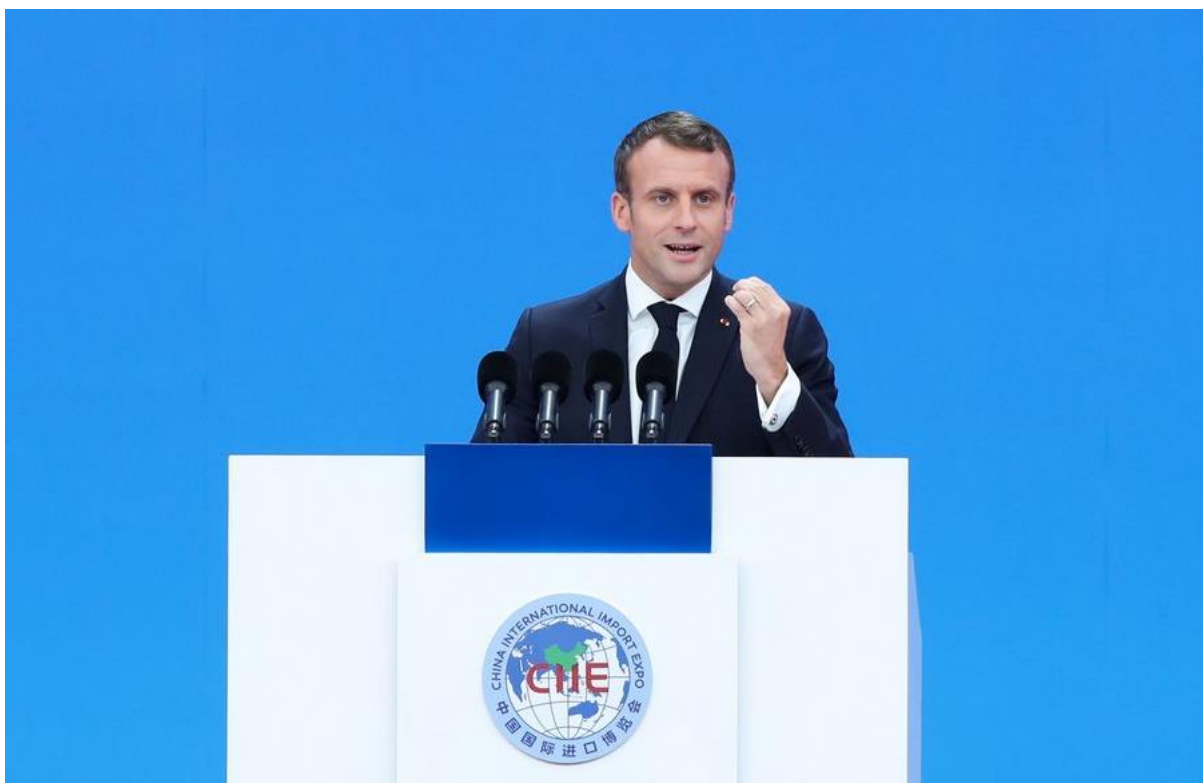
French President Emmanuel Macron addresses the opening ceremony of the second China International Import Expo (CIIE) in Shanghai, China, November 5, 2019