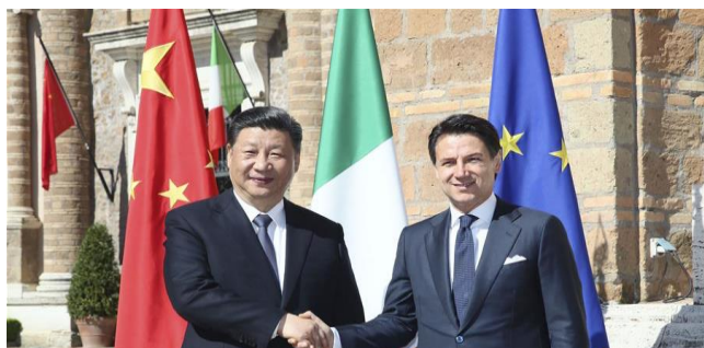
Chinese President Xi Jinping and Italian Prime Minister Giuseppe Conte held talks in Rome, Italy, March 23, 2019, when Italy signed a memorandum of understanding (MoU) with China to advance the construction of the Belt and Road

China made major headway in its relations with Europe over the last two months. In his first overseas visit in 2019, Chinese president Xi Jinping toured Italy, Monaco and France from 21-26 March. The highlight of the visit was Italy signing on to China's Belt and Road Initiative, becoming the first G-7 country to be inducted.