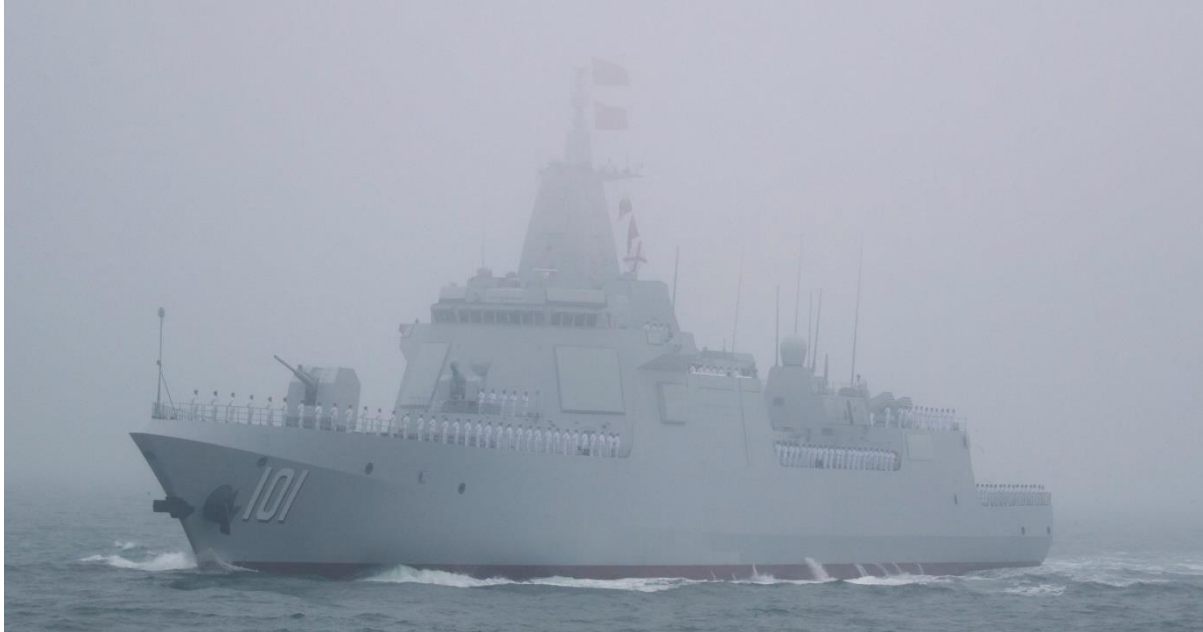
Chinese People's Liberation Army (PLA) Navy's new type 055 guided-missile destroyer Nanchang participates in a naval parade to commemorate the 70th anniversary of the founding of China's PLA Navy, Qingdao, April 23, 2019.

warships from India. It regretted that the United States did not send a warship to participate in the celebration, although in 2009, one of its destroyers participated in the maritime military parade marking the 60th anniversary of the PLA Navy. 11