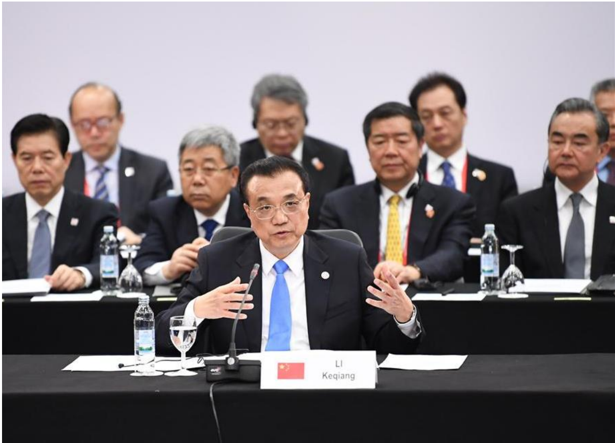
Chinese Premier Li Keqiang attends the eighth leaders' meeting of China and Central and Eastern European Countries (CEEC) in Dubrovnik, Croatia, April 12, 2019.

Switzerland, an important European economy with much international influence, soon followed suit. The Chinese side believes that these developments have significantly enhanced the credibility of the BRI initiative.