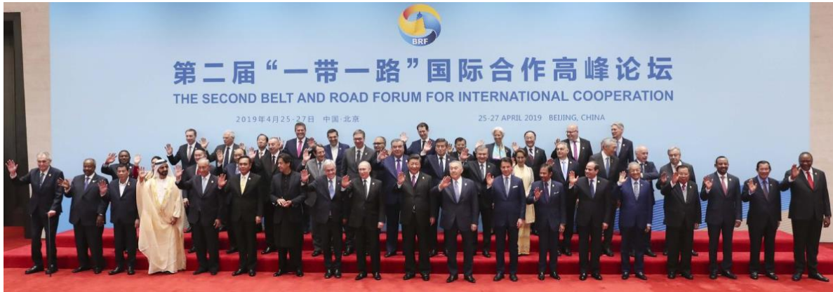
President Xi Jinping and foreign dignitaries pose for a group photo following the leaders' roundtable at the Second Belt and Road Forum for International Cooperation in Beijing, April 27, 2019.

The Second Belt and Road Forum for International Cooperation was held in Beijing from April 25-28, 2019. The three-day forum was projected as China's most important diplomatic and high-profile global event for the year. Around 5,000 foreign guests from more than 150 countries and 90 international organizations attended the conference, with the grandiose theme of "together building the One Belt One Road and creating a better future."