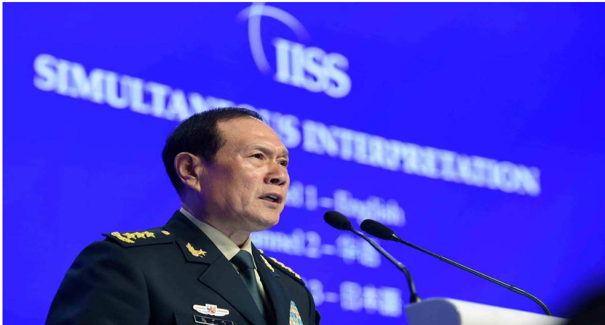
Chinese Defense Minister General Wei Fenghe speaks at the Shangri-La Dialogue in Singapore on June 2, 2019.

Meanwhile, China is gearing up for hosting and participating in several major military events in the following months. First, China will host the 7th International Military Sports Council (CISM) Military World Games in Wuhan from October 18 to 27, 2019 on the theme "Sharing friendship, upholding peace". Second, it will participate in the International Army Games-2019 with Russia, Kazakhstan, Belarus, India and Iran in the first half of August, 2019. Third, it will host the "Great Wall-2019" international Counter-terrorism Symposium organised by the People's Armored Police (PAP).