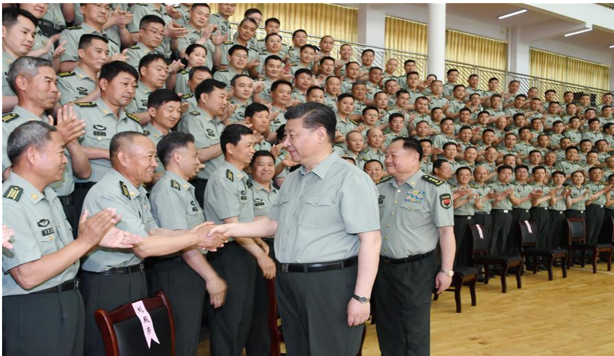
Chinese President Xi Jinping at an inspection tour to PLA Army Infantry Academy in east China's Jiangxi Province on May 21.