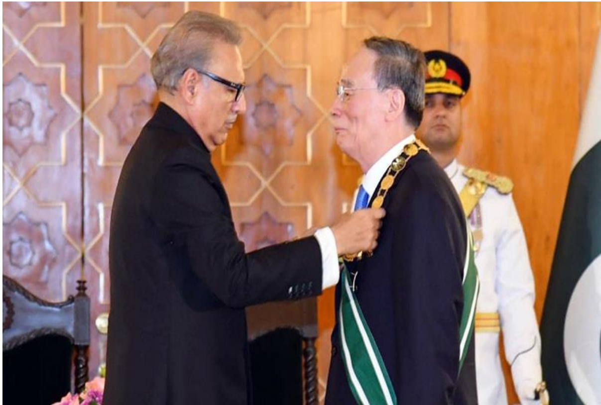
Pakistani President Arif Alvi conferred Pakistan's highest civil award, the Nishan-e-Pakistan, on Chinese Vice-President Wang Qishan in Islamabad, May 25, 2019.

Source: Dawn, https://www.dawn.com/news/1484713