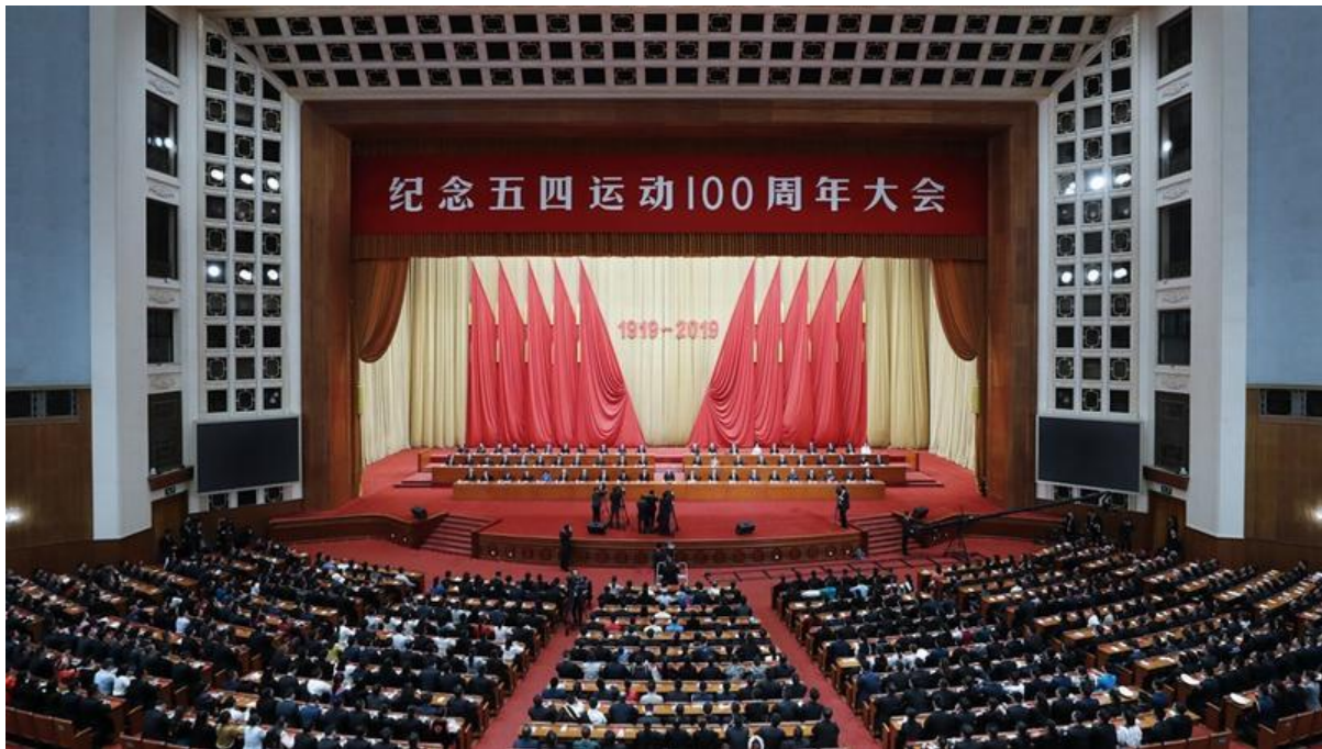
Chinese President Xi Jinping addresses a ceremony marking the centenary of the May Fourth Movement at the Great Hall of the People in Beijing on April 30, 2019.