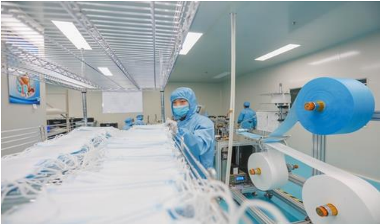
A staff at work in a factory producing face mask in Sichuan Province

Despite the otherwise buoyant national mood, one cannot but miss a growing sense of unease and scepticism in China about the 'anti-globalisation' trend further gaining currency as a fallout of the pandemic, with a real possibility of the world adjusting and reducing its supply-chain dependence on China. Furthering Chinese economic woes, data released by the National Bureau of Statistics indicated that in January and February 2020, China's fixed asset investment fell by 24.5%, total retail sales of goods fell by 20.5%, industrial value added fell by 13%, and imports and exports fell by 9.6% year-on-year.