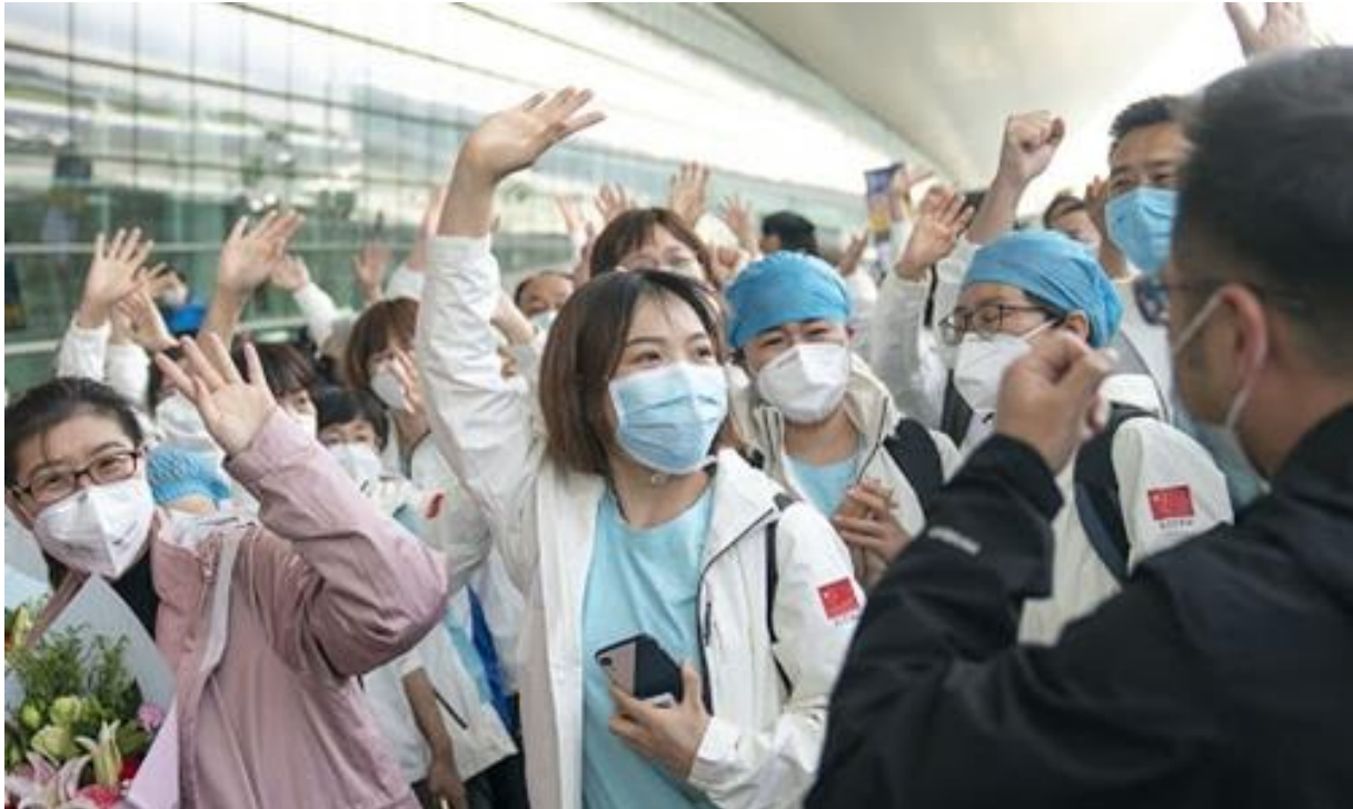
China's Emergency Medical Rescue Teams leaving Wuhan after the epidemic was reportedly "brought under control", March 18, 2020, Source:

https://www.chinadaily.com.cn/a/202003/18/WS5e7193c5a31012821728009b.html